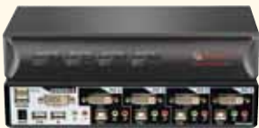
SwitchView DVI switch

The SwitchView DVI (Digital Visual Interface) KVM switches feature 1920 x 1200 video resolution and deliver crisp images for your high-end displays and flat panel monitors. The versatile SwitchView DVI KVM switch is available in 2 and 4-port models. It easily manages up to four USB DVI computers from a single USB keyboard, mouse and DVI monitor.